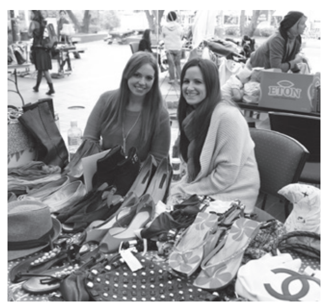
Garage Sale Trail

it was just such a very, a huge thing to grapple with, as to how could Melbourne University be involved. So there was always a lot of talk about volunteers and using the students as volunteers. [...] I know the acronyms change all the time with that section in the university that deals with student leadership – there was the SALP team and there were a few others that don't happen anymore and the staff have come and gone a lot I've noticed. So to me that was all very well, but those are things that had been happening already anyway (CW2).