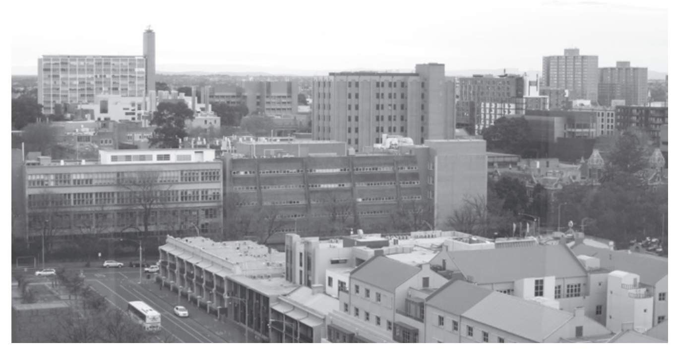
Part of the University of Melbourne's Parkville campus. The two towers on the right belong to the Carlton public housing estate.

These findings inform University engagement strategies to foster respectful, fruitful and sustainable partnerships with people and groups in the community experiencing disadvantage and marginalisation and for whom such partnerships can deliver many benefits.