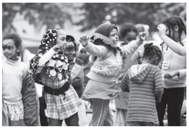
Harmony Day, Carlton, 2011

With regard to the need for a long-term commitment from the University, the informants were agreed that if the support of the partnership consultants were withdrawn there are high risks that the relationships that have been developed would atrophy or be lost. Small, poorly-funded organisations do not have the resources needed to build and maintain relationships that are not absolutely essential for meeting their service obligations.