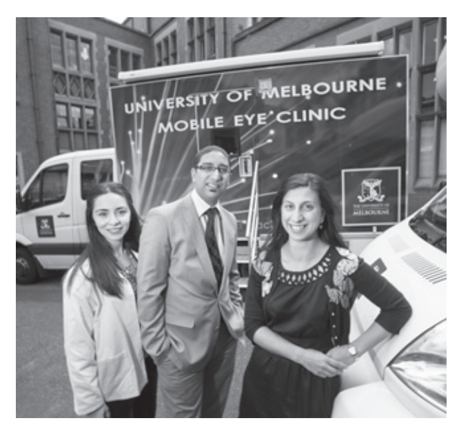
Free eye tests at Harmony Day, Carlton

This sort of engagement work will, I think, always suffer in relation to research and teaching, although it's supposed to underpin and support all of it. It is the kind of work that people, I always felt in a way that I was asking people to do favours rather than it being a really validated, like, valid, recognised piece of their work or part of the, you know, role, and if it didn't have immediate, say, research opportunities then, or if it didn't immediately help their students in some way, then it was a favour (UM staff 2).