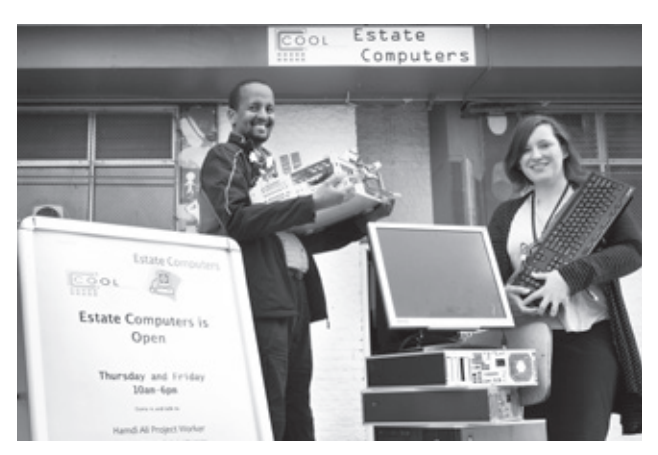
COOL and Estate Computers projects