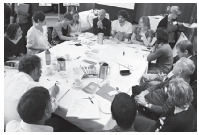
Roundtable Discussion, Carlton, 2013

Melbourne declares its intention to make research, student learning and engagement serve public ends. This includes taking up pressing societal problems in research, producing graduates prepared for responsibility, and promoting inquiry and open debate based on evidence and reason (University of Melbourne 2010:7)