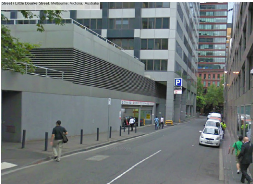
Gresham Street. Private developer funded, construction underway