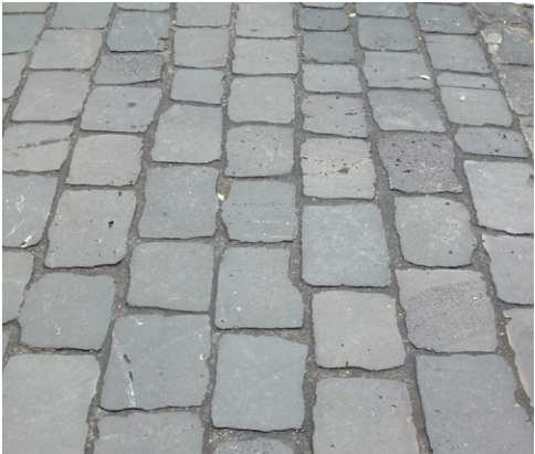
Proposed paving upgrade with smooth surface

The proposed surface finish to the heritage bluestone pitchstone paving is achieved by lifting each pitchstone, cutting flat the top surface and relaying it. This treatment aims to retain the heritage value whilst providing a more pedestrian friendly surface.