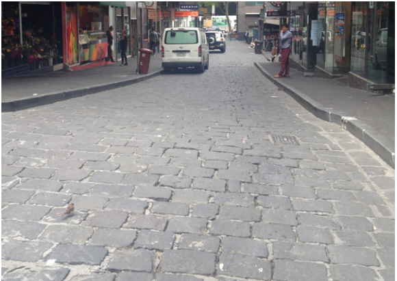
Existing pitchstone paving requiring upgrade